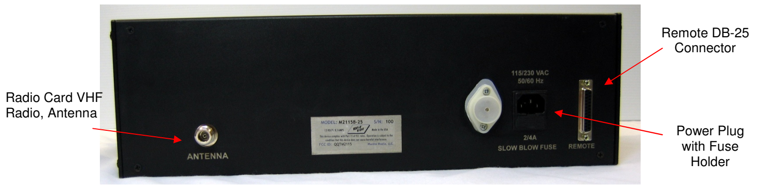
Fig 3 - M2115B-25 (See Rear Panel for specific component functionality)