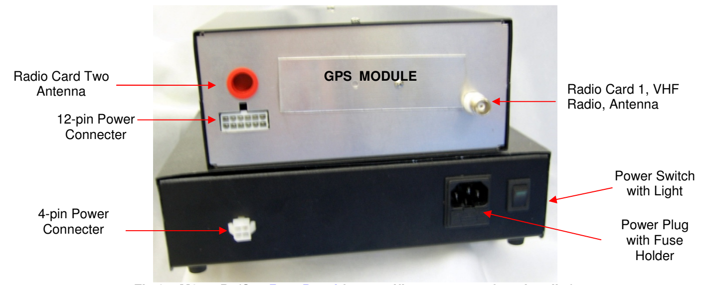
Fig 2 - M2115B (See Rear Panel for specific component functionality)