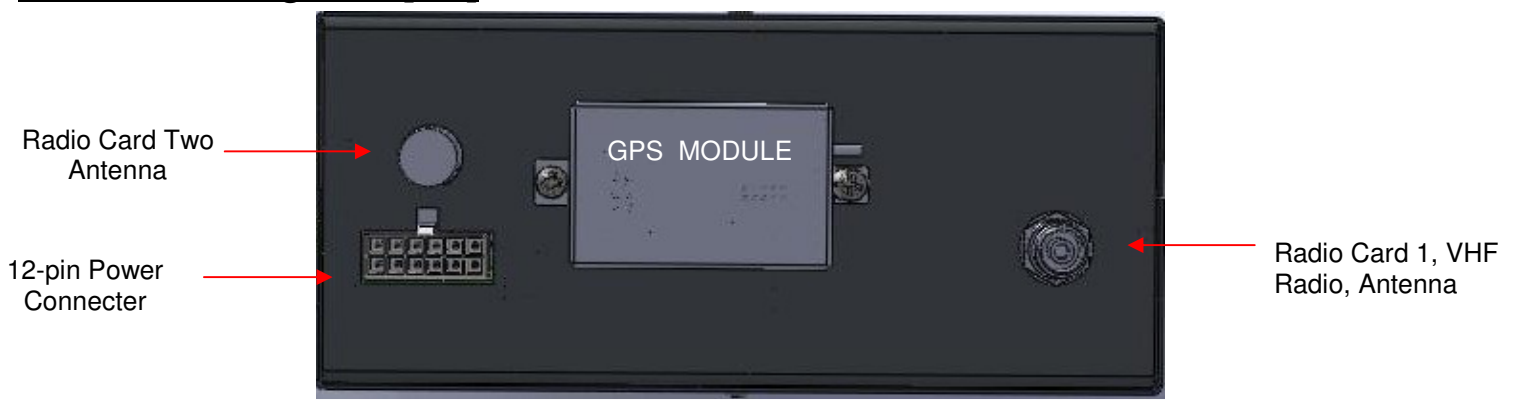
Fig. 1 – M2115M (See Rear Panel for specific component functionality)